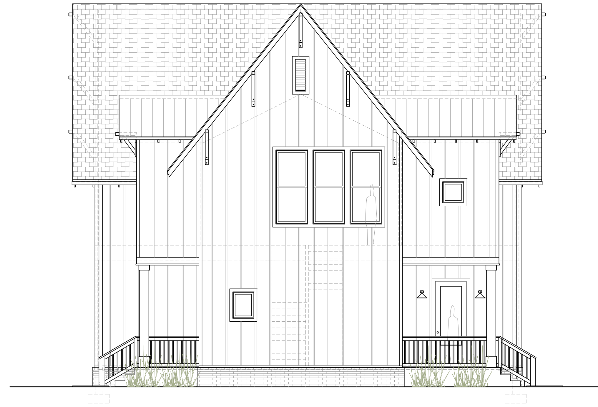
COTTAGE PLAN - B1 SIDE ELEVATION 3/16" = 1'-0"