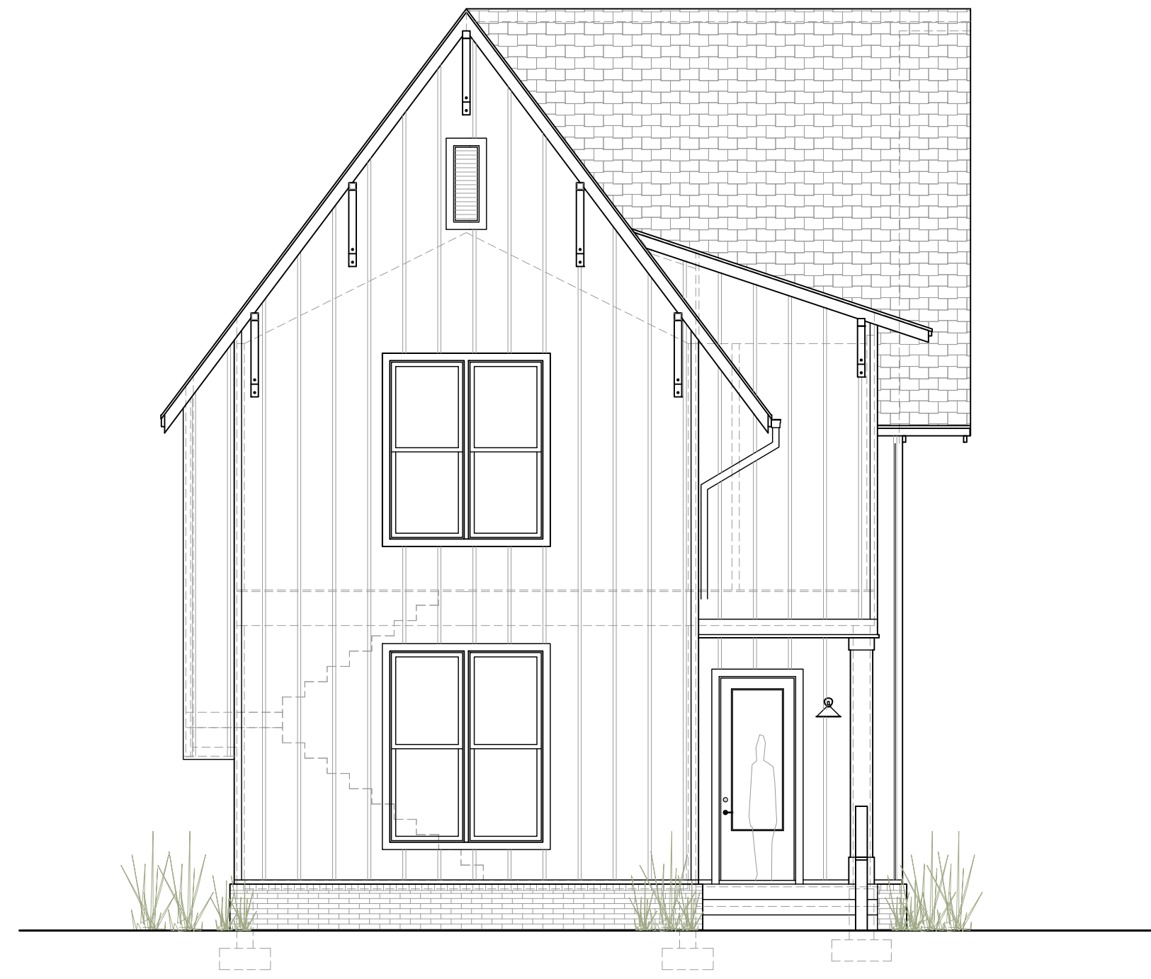
COTTAGE PLAN - B1 FRONT ELEVATION 3/16" = 1'-0"