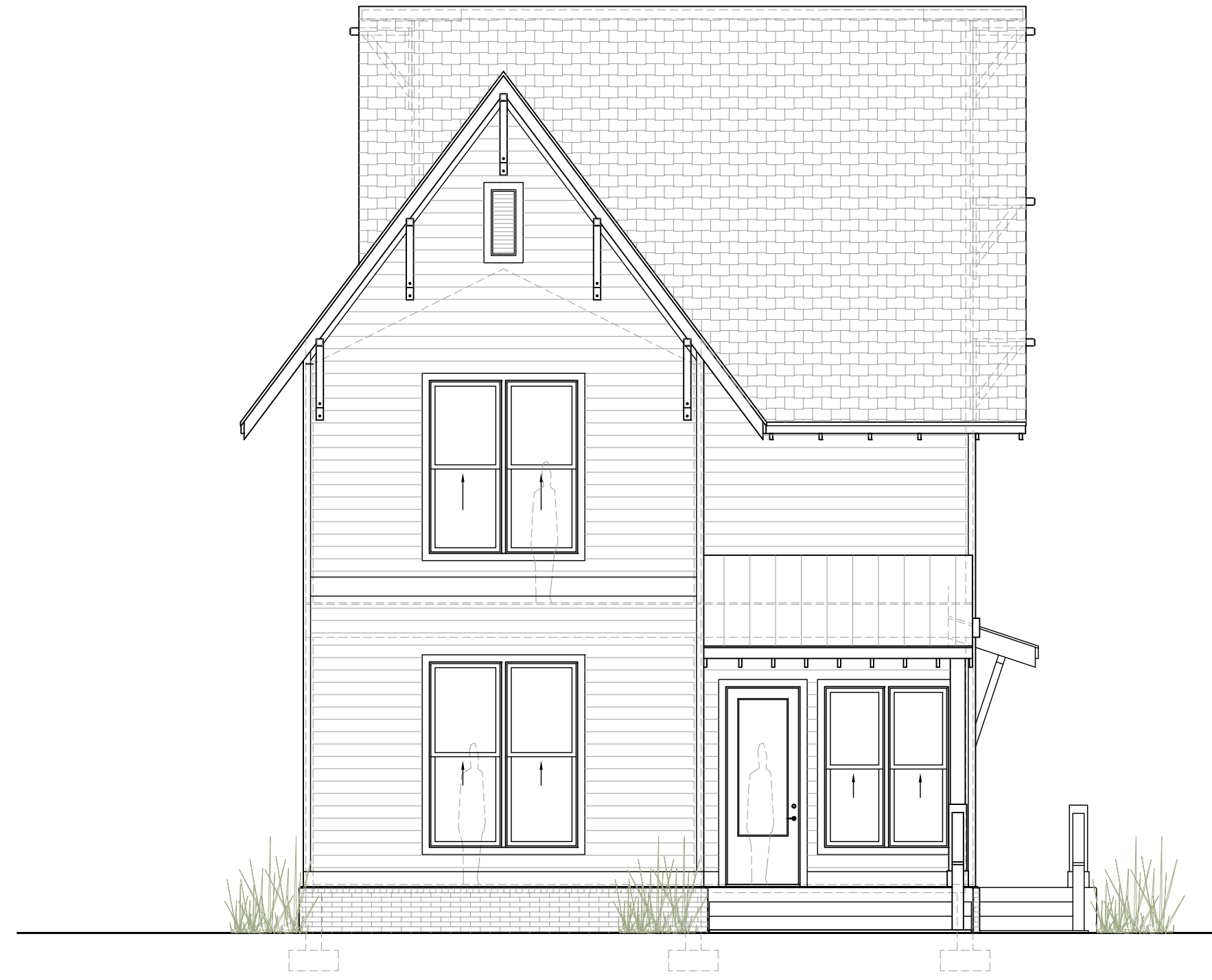
COTTAGE PLAN - A1 FRONT ELEVATION 3/16" = 1'-0"