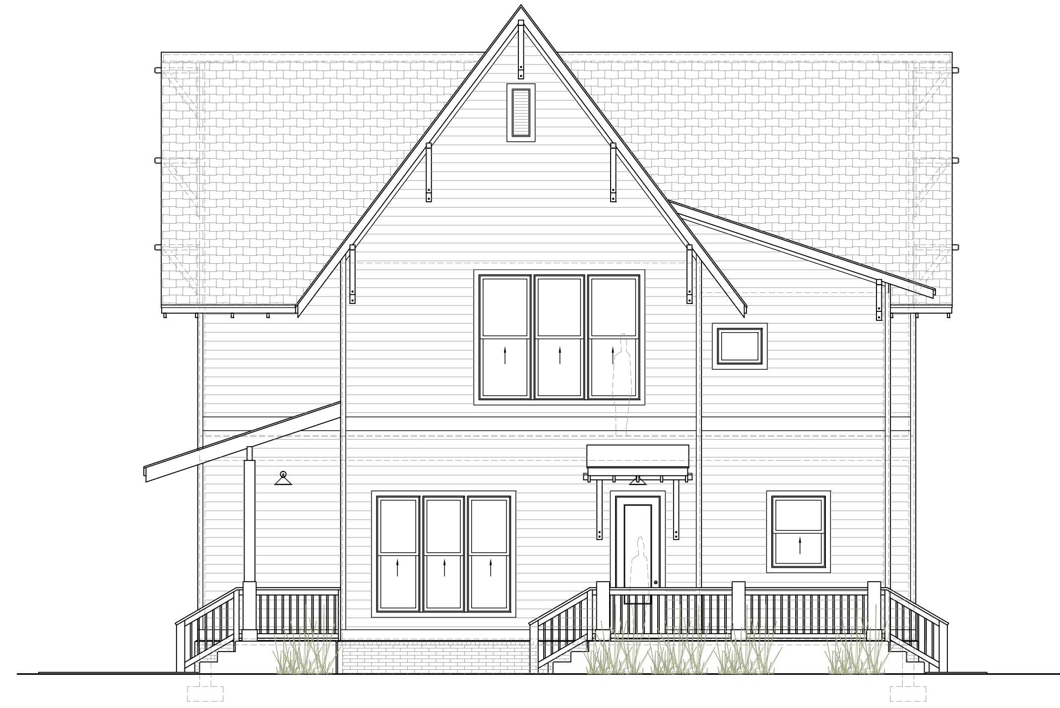
COTTAGE PLAN - A1 SIDE ELEVATION 3/16" = 1'-0"